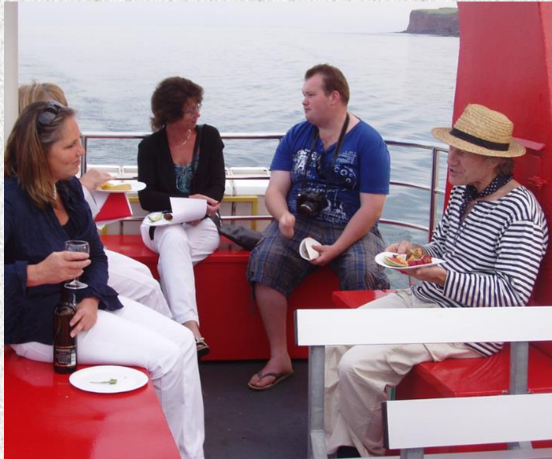
Summer Social on the Exe Estuary