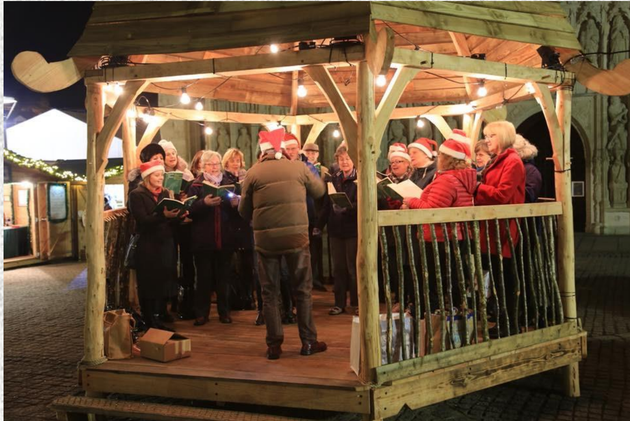
Exeter Christmas Market 2017