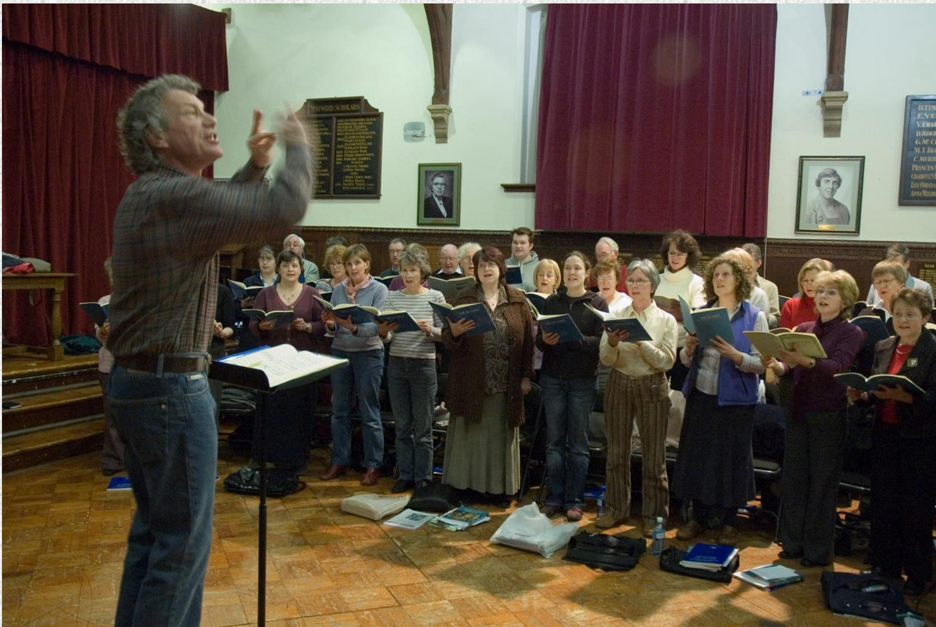
Regular Wednesday rehearsal at The Maynard School 2006