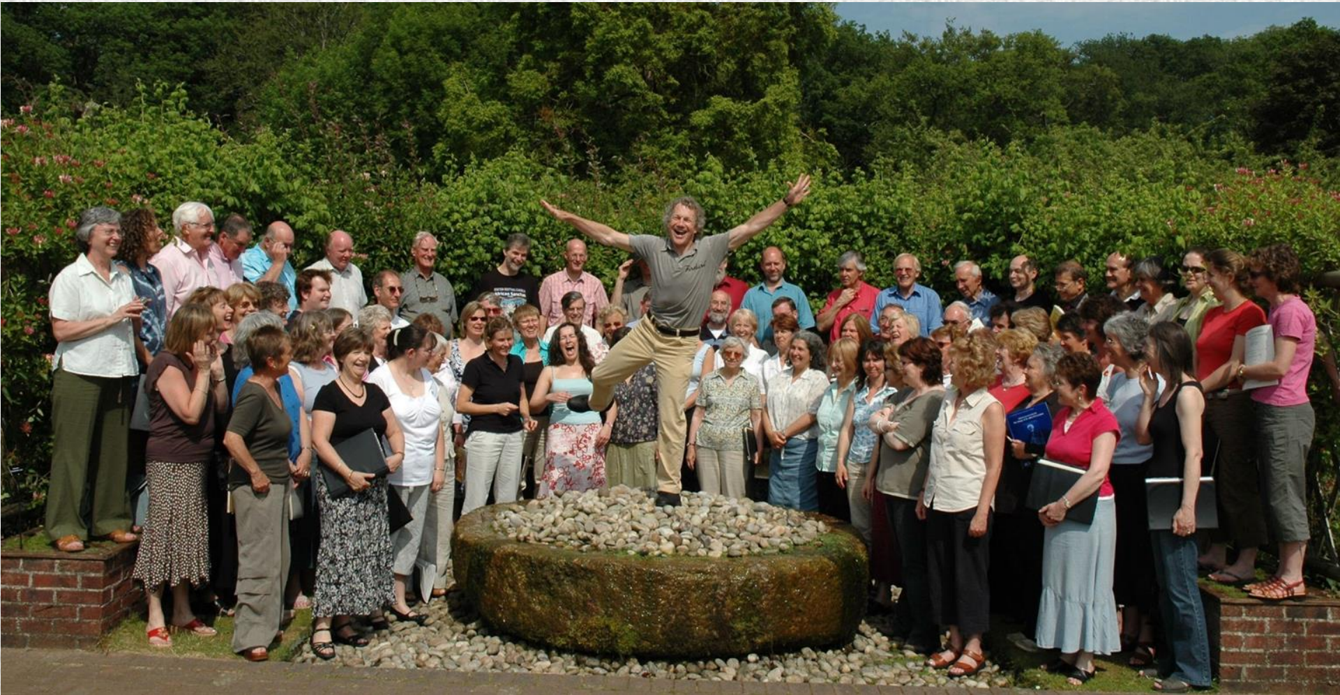
Some light relief before Rachmaninov Vespers, Buckfast Abbey 2006