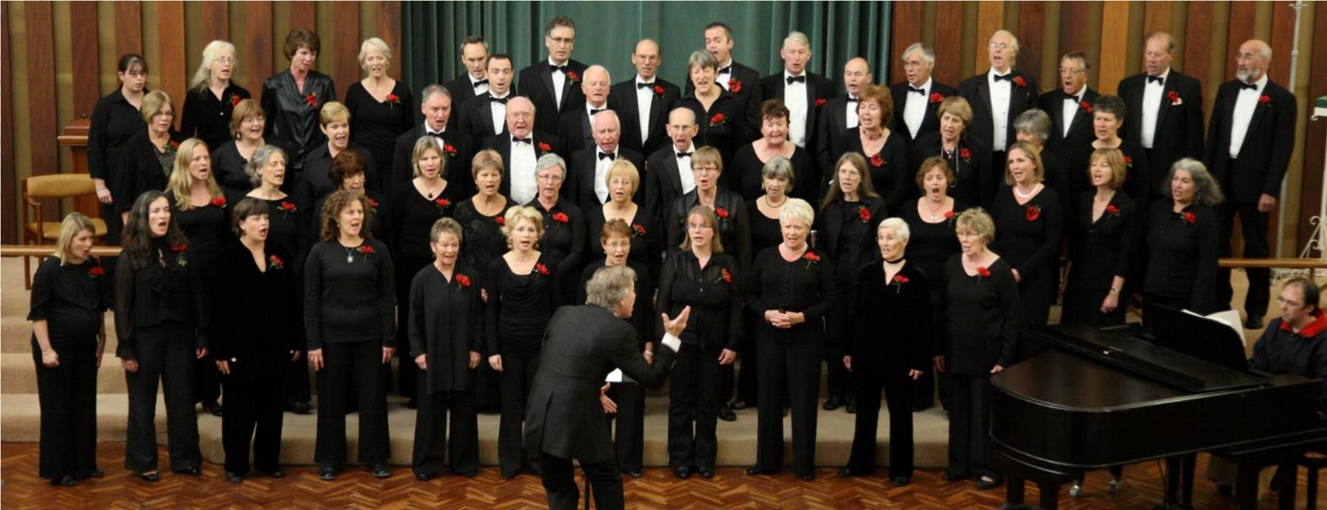
Dress Rehearsal at The Mint Church Exeter, 2009